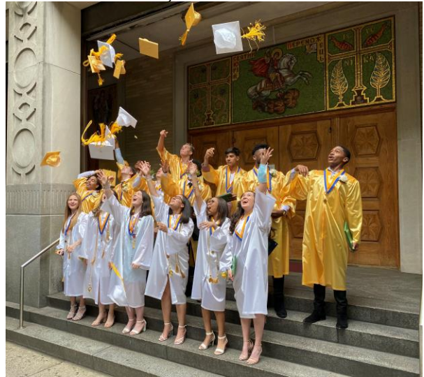
Presenting the SGA Cass of 2021

Congratulations to the Class of 2021! We are so proud of you! May God Bless You and help you to achieve your dreams!