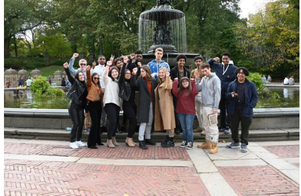
SGA Class of 2021 in Central Park